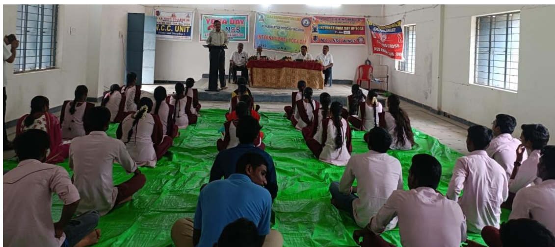
Principal addressing on the occasion of yoga day