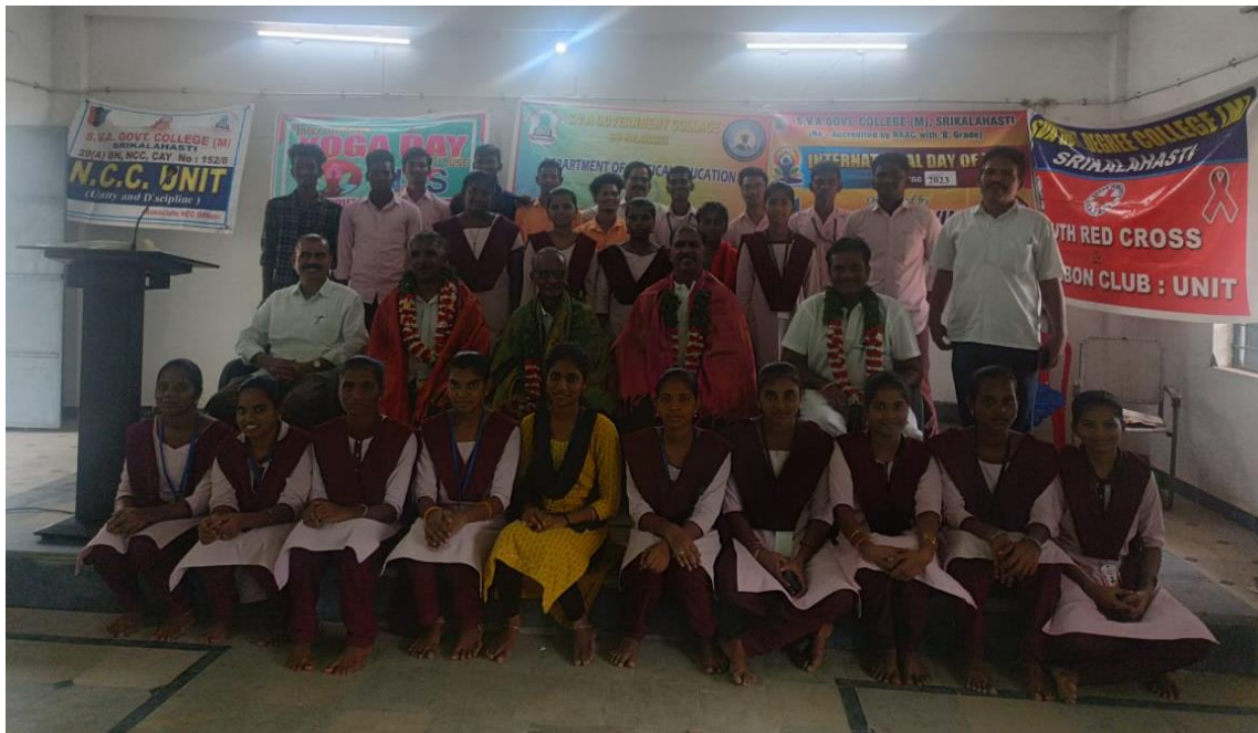
Felicitation to yoga guru and his disciples