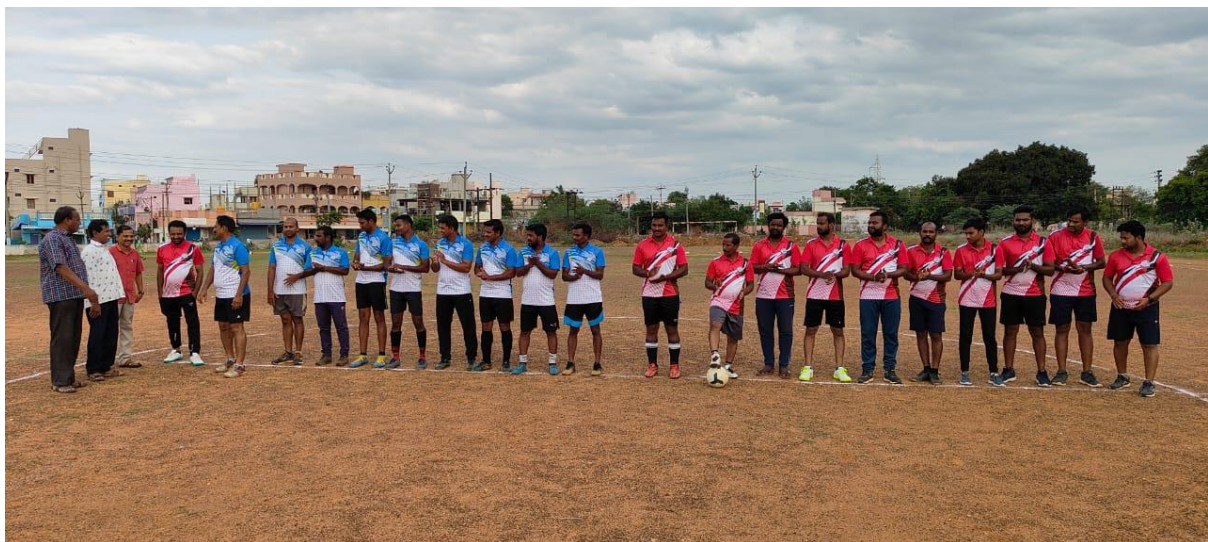
Alumni of the college